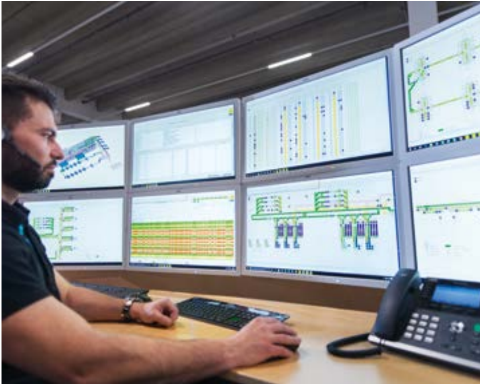
← Control center with psb selektron WMS and selektron SCADA for controlling and monitoring the intralogistics system installation

The psb concept for api includes combined goods-in and packaging workplaces: at the beginning of the day almost all workplaces are used for goods-in processes. The closer the end of order entry or cut-off times, the more workplaces are used for packaging. The maximum shipping capacity of 56 combined workplaces is then 1,400 parcels per hour. By this double utilization and the smaller number of workplaces, psb reduces the required space and thus the implementation and operating expenses.