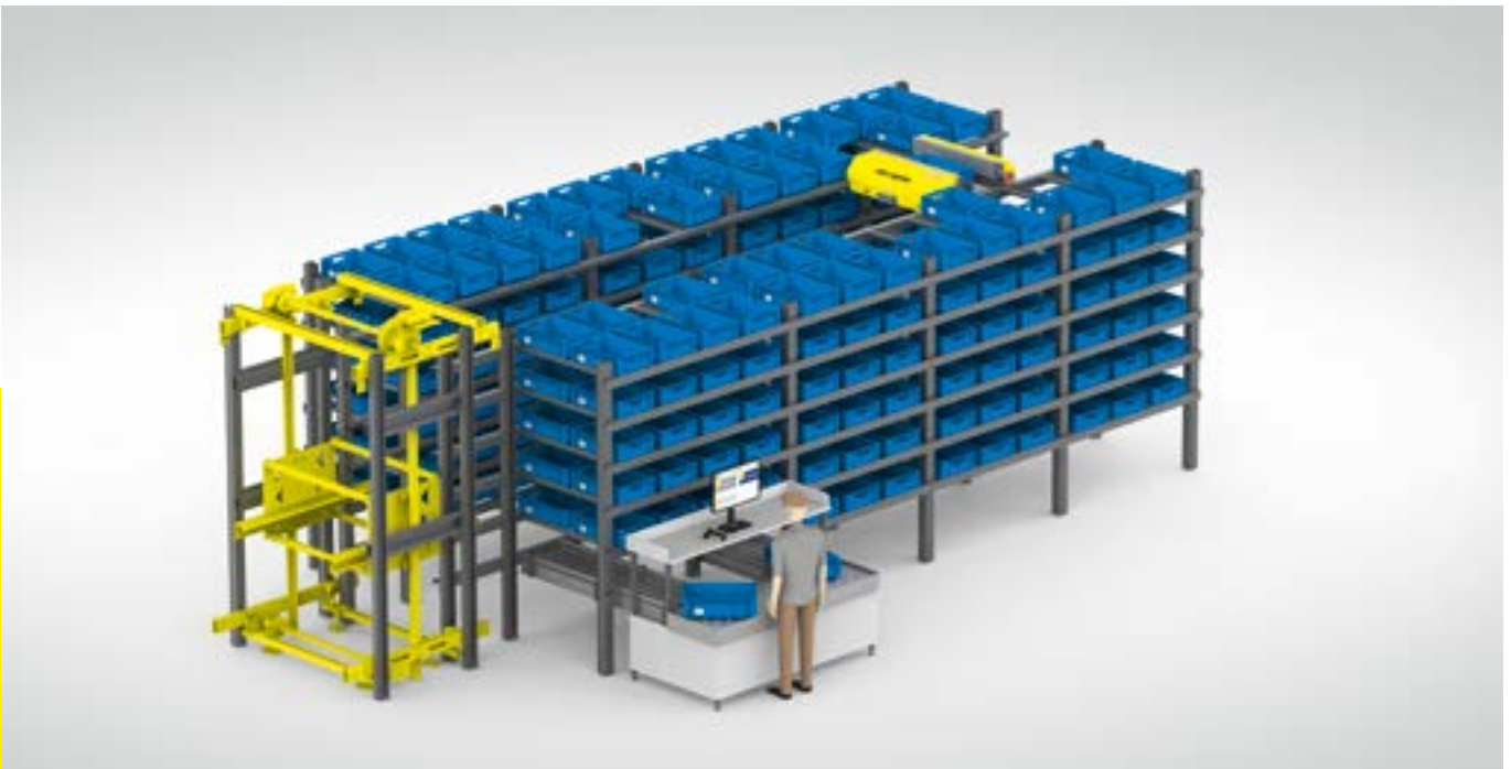
↑ psb microstore: flexible in height and length